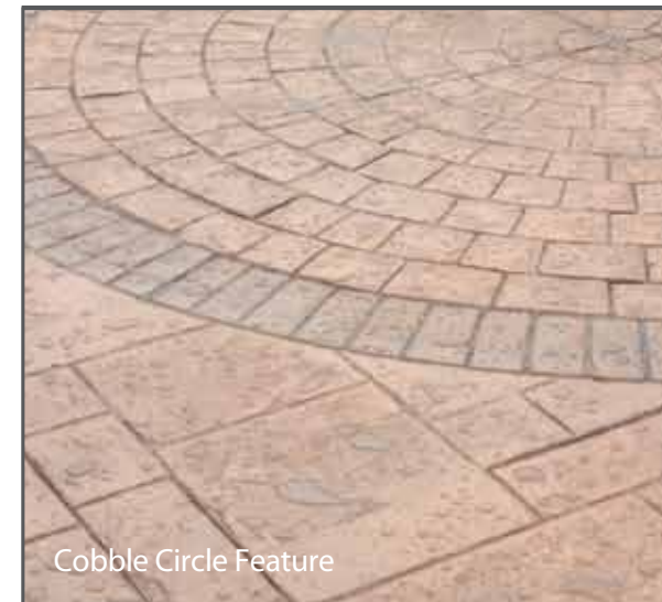
Cobble Circle Feature