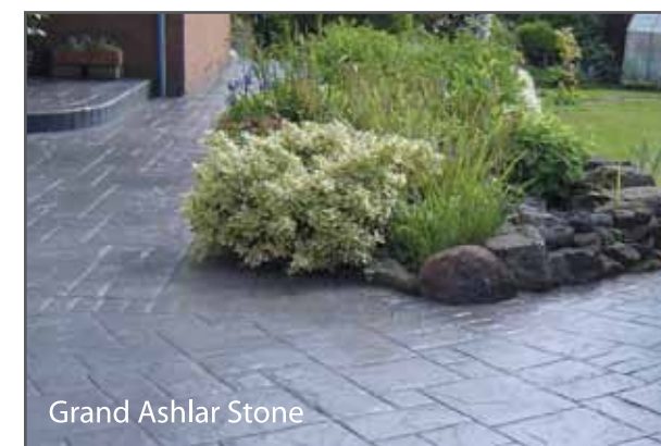
Grand Ashlar Stone