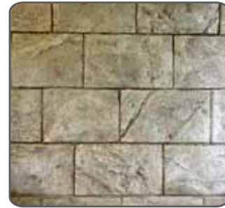
Large Cobble Paver