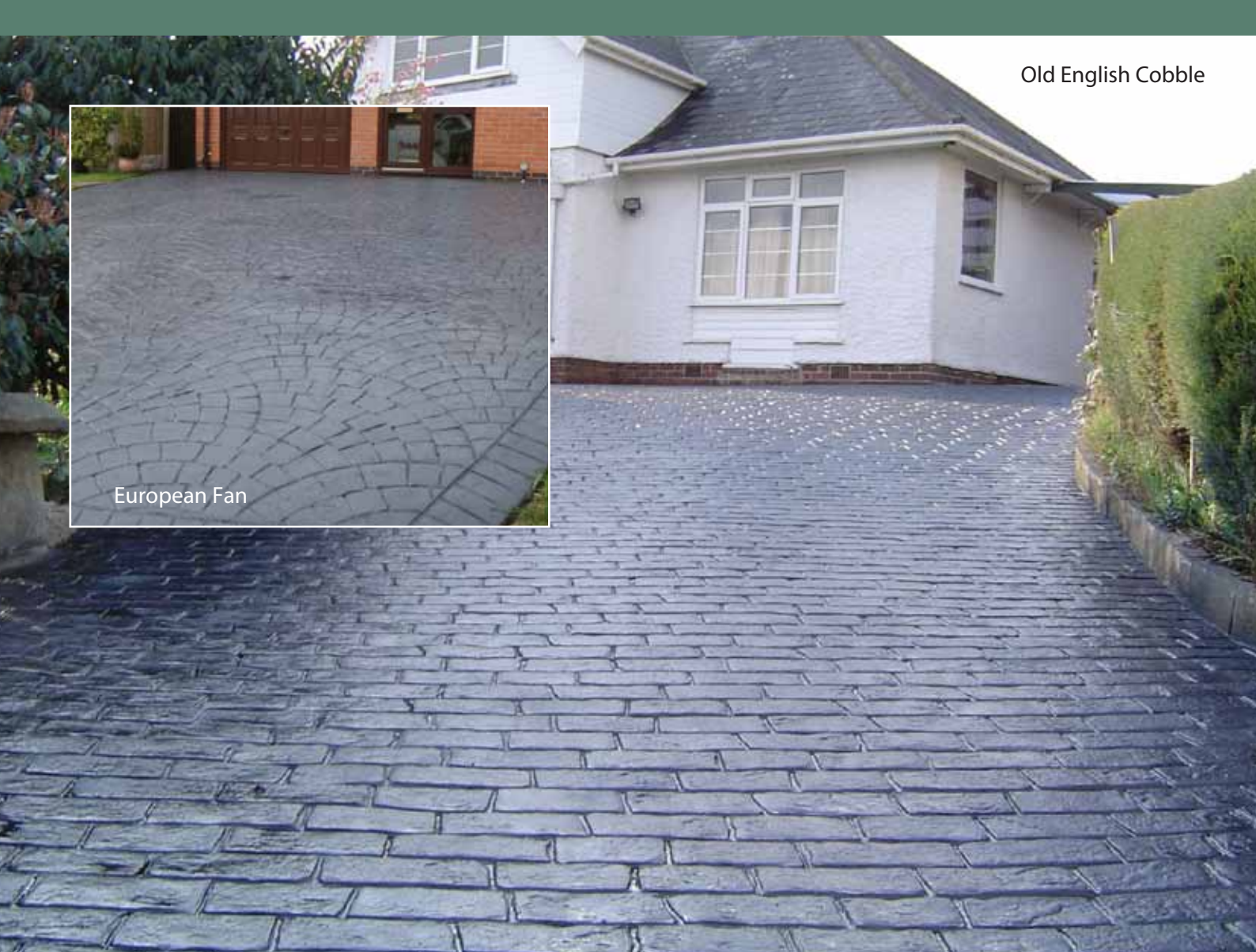
Old English Cobble