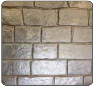
Old English Cobble