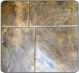
Side Walk State