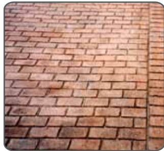
Running Bond Brick